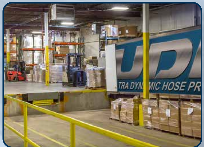
Shipping to customers world-wide with world-class hose and tubing products.