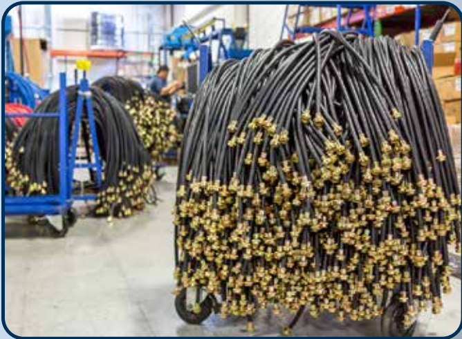
Producing hose assemblies in large quantities is a daily routine.