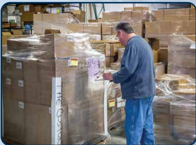
Inspection and quality is paramount with unparalleled customer service.