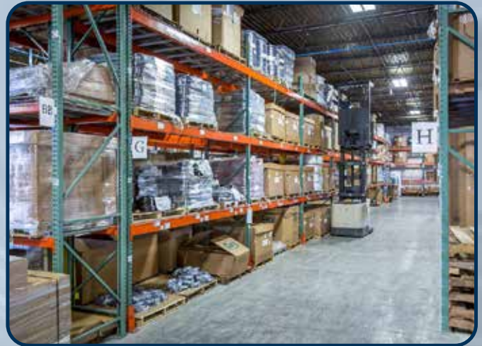
Inventory on-hand to service our customer needs. Large stocks for immediate shipment.