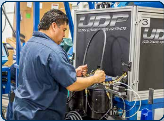
Hose assemblies fabricated to customer requirements - our specialty. Let us know what your requirements are.