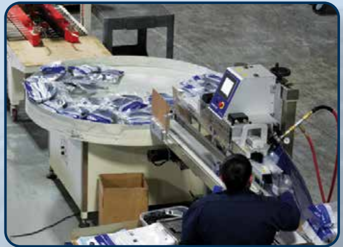
Complete packaging services available. Bagging, tagging and bar coding are just a few of the value added services we offer.