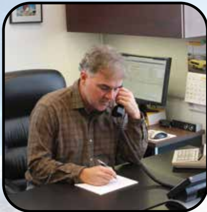
Order Entry and Technical Assistance - Our Specialty

We welcome you to visit our 112,000 square foot facility in Itasca IL.