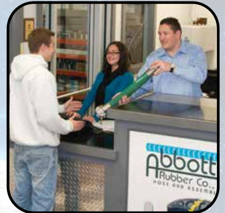
Unparalleled Personalized Service

Serving the Construction Market for Over 70 Years